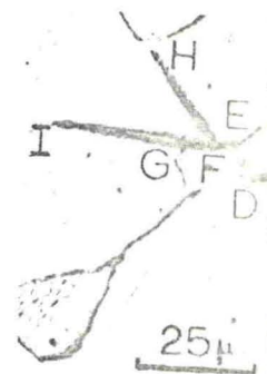
Composite micrograph of a curved surface.

where A and B are... given temperature... at all strain rates... sintered tungsten at